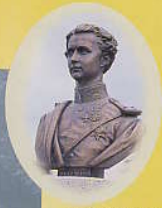
King Ludwig II of Bavaria.