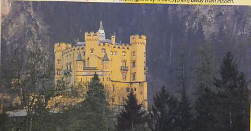
Hohenschwangau Castle, the nursery of the fairy-tale king, is only 3 miles (5 km) away from Füssen.