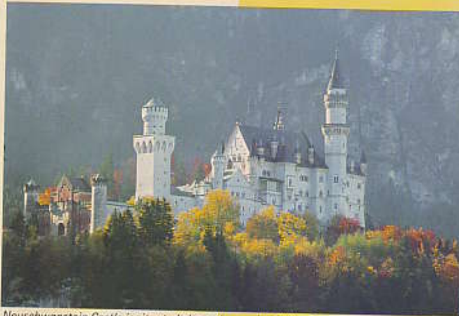
Neuschwanstein Castle is situated above the roaring Pöllat Gorge, 3 miles (5 km) from Füssen.