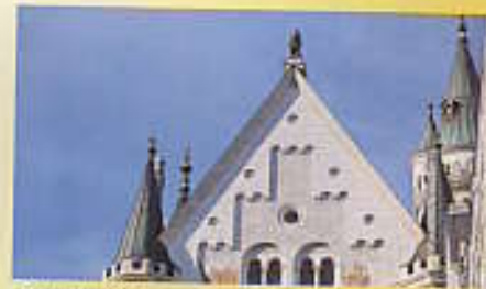
Detail of Neuschwanstein Castle

Please note: The royal castles Neuschwanstein and Hohenschwangau are signposted with the German word "Königsschlösser"!