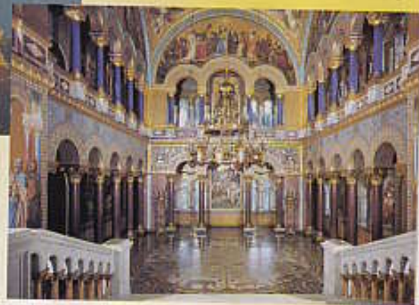
The Throne Room at Neuschwanstein